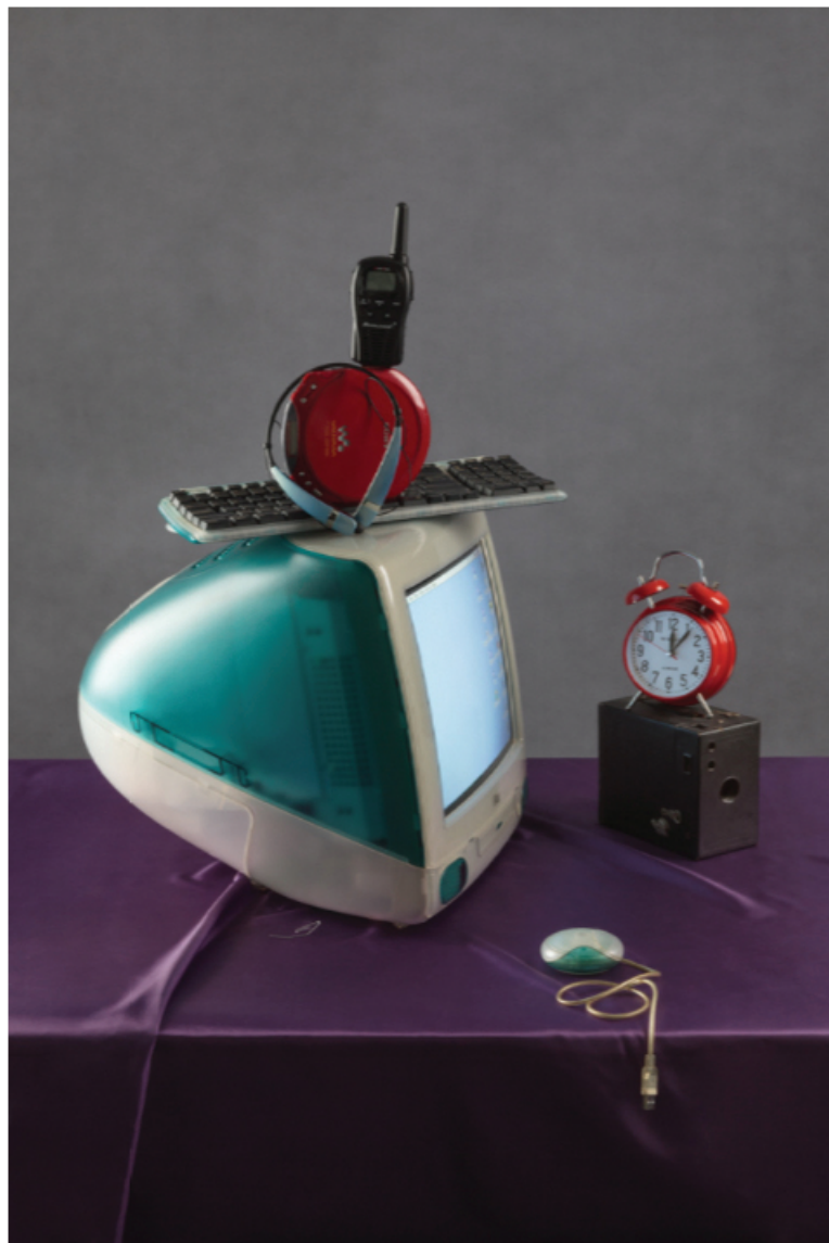
Tech Vanitas: Blue iMac

A journey through images and music tells the digital transformation